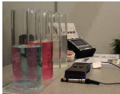
Figure 4. HYDROSYS demonstrated to general public during InfraTech 2011 in Turku, Finland