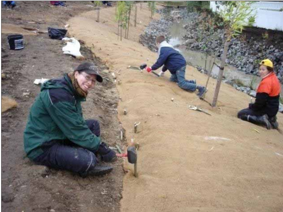
Figure 2. Volunteers during the stabilization of 200m section of Ridalinpuro stream during 2008

As a direct result, HYDROSYS system contributed substantially to the increase of environmental awareness of the local citizens or volunteers by providing them an opportunity to get a snapshot of the state of the environmental state in the site and consequently base their actions on this state.