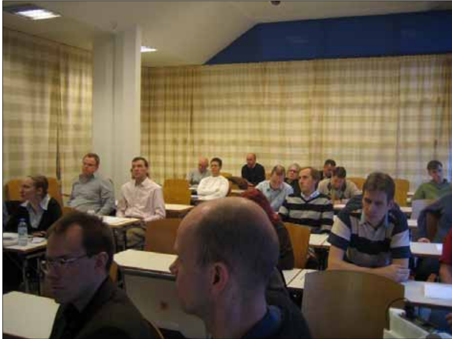
Figure 3. End-users and citizens during the Lahti workshop in 2009

A similar event titled “Environmental modeling seminar” was organized by Aalto University, Lahti group in Finland during February 2009. This event exposed the HYDROSYS system to the environmental modeling academic community. The participants were acquainted with the system seen from a scientific perspective, as a tool available to environmental researchers to perform on site modeling an related tasks. The last noticeable event that involved the general public was the “InfraTech 2011 Exhibition” on 18.-20.5.2011 in Turku, where over 5 000 public utilities industry oriented visitors were gathered to find out the latest innovations and products of the field. The HYDROSYS project was presented and the complete prototype was demonstrated to the public on a stand [Figure 4]. The system was thought by public as a practical tool both for experts and common people dealing with environmental issues, and in general it was seen as a required step in the development of environmental monitoring and planning.